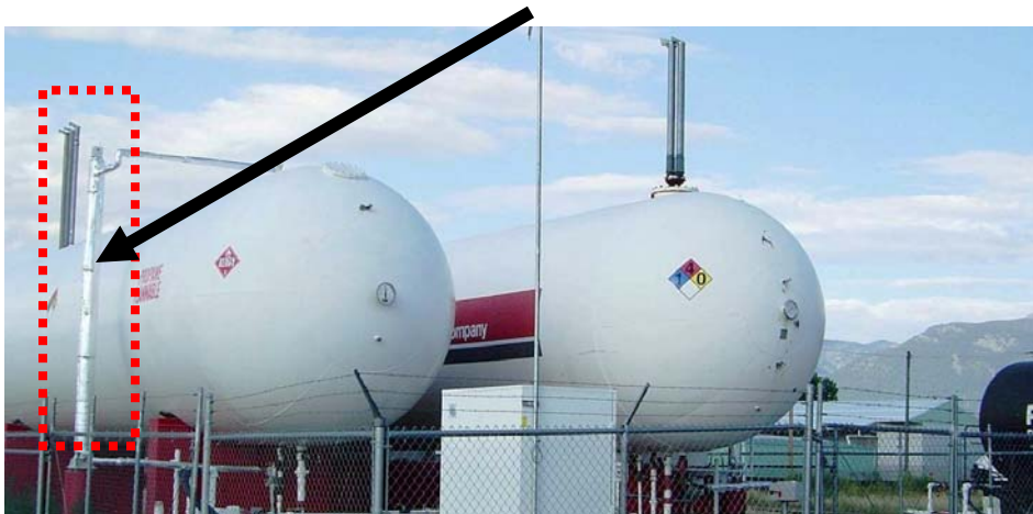
MMC - Mass Measurement Chamber

A solution for existing bulk storage tanks that lack an opening for the precision gauge. Mount the gauge in an external fabricated chamber to simulate the actual tank. While retaining the accuracy it did raise the cost of the installation. A number of these are installed in the US, Mexico, Jamaica, and The Dominican Republic. The MMC is a very good solution to tanks without a 2" top opening available. Often this is a case with the "MultiPort™" type PR valves.