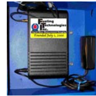
Indoors Version, in a mounting enclosure. Enclosure has a cover, not shown in this picture.

Enables better factory support. Your site can be serviced by FTI's home office easily and conveniently, In most cases this support can be done without onsite technicians, quickly and usually without charge.